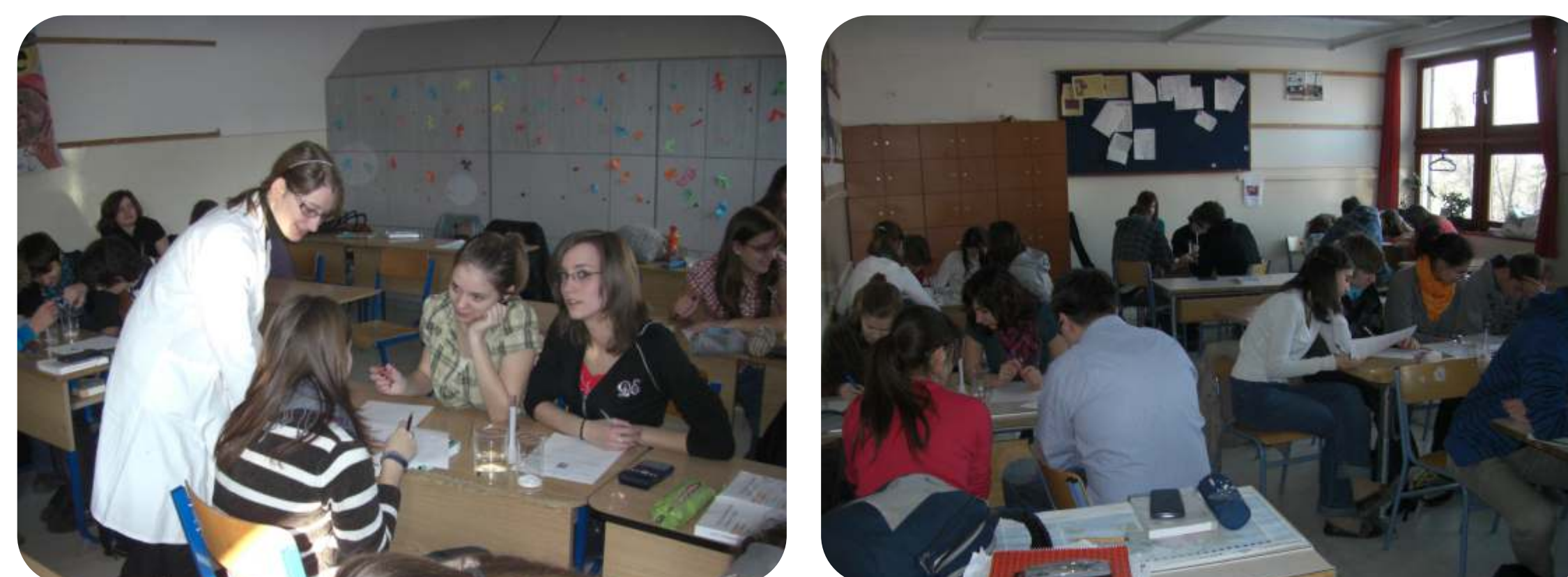
Figure 3.: Trials of the student sheets that required to design an experiment modelling either how the self heating or the self cooling cups work.